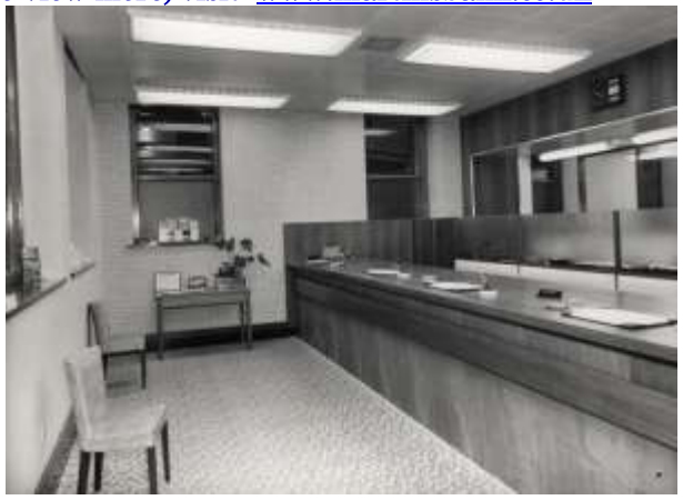
One final image of the counter of the branch

To view more, visit: www.martinsbank.co.uk