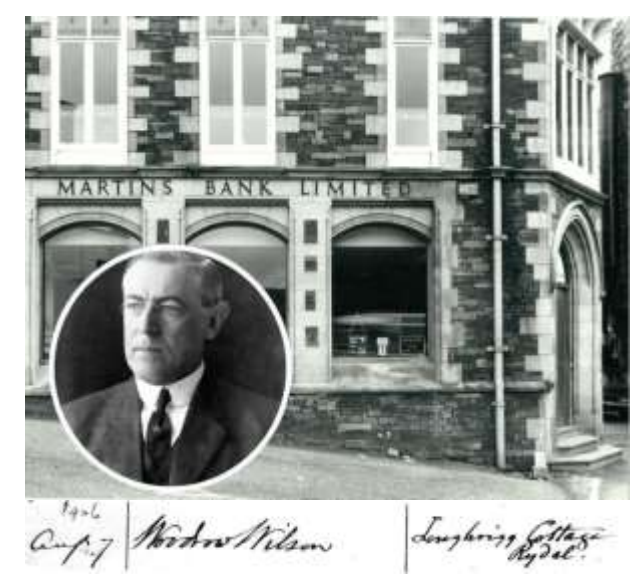
Opened in 1871, it is one of the oldest of Martins Bank Lake District Branches and comes from the amalgamation in 1893 of Messrs Wakefield Crewdson's Kendal Bank and the Bank of Liverpool.