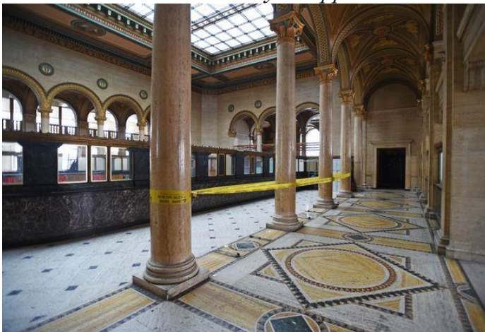
The grand banking hall

But in 1969 Martins was taken over by Barclays and the famous name slowly disappeared.