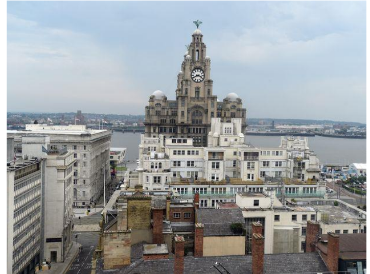
View from the Chairman's flat in the Martins' building