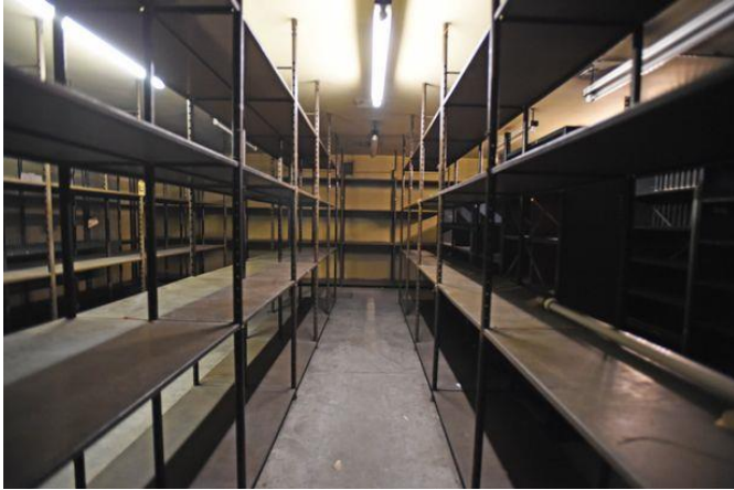
Inside the vault where Britain's gold reserves were stored during World War Two

In 1940, with the threat of German invasion looming, much of Britain's gold reserves were moved to the bank's vault.